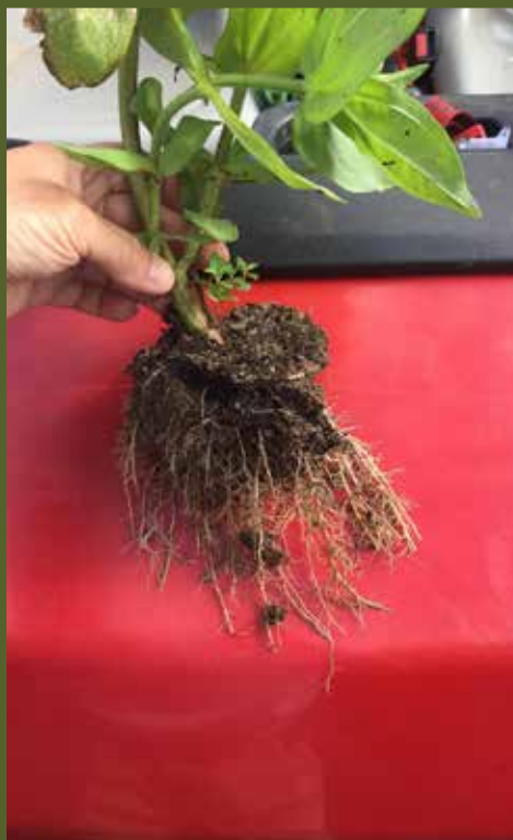
Root development of Zinnias (left) and a garden of Zinnias (right)