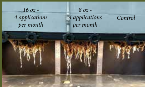
Oak Hill Country Club Practice Green