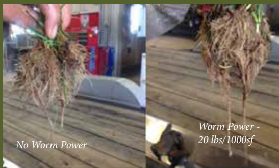
Turf plugs from new seeding

Worm Power will enhance plant vigor and improve stress tolerance, for turf that will thrive throughout the season.