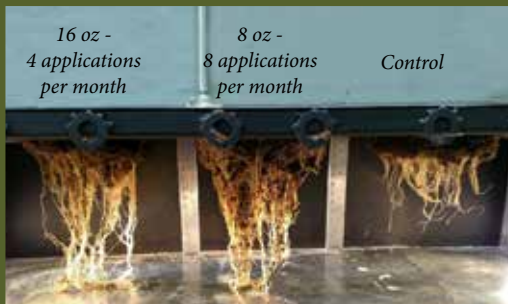
Oak Hill Country Club West Course Fairway

Through ten years of trials and university research with top leading land grant university's, Worm Power has consistently been shown to produce stronger, healthier and more vigorous plants.