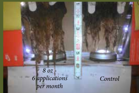
Oak Park Country Club #8 Green