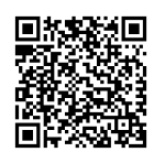
Scan for more information on Jacklin fine fescues