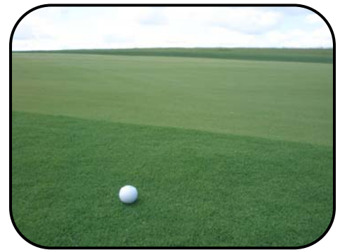
L-93 XD cut at fairway height surrounding a green in Lexington, KY.