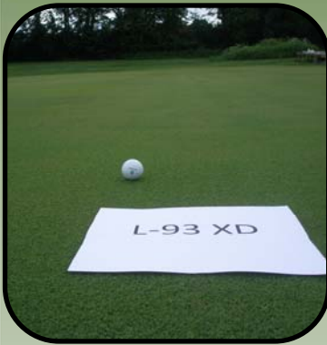
L-93 XD on a green in Lexington, KY