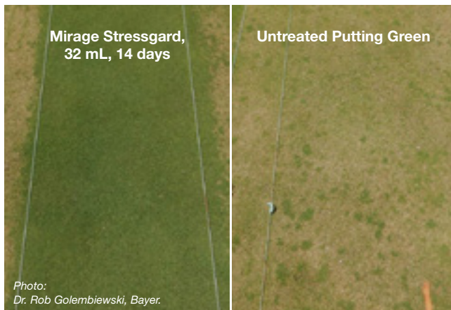
Michigan State University creeping bentgrass research putting green. Photo shows dollar spot control during mid-summer 2016.