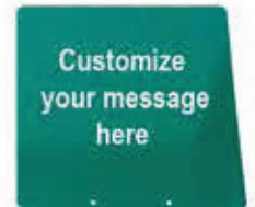
Part No. 500

Available in White and Green. Spikes sold separately, spikes are at the bottom of the page.