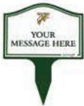
Part No. 591

Produced from a single piece of 3mm metal, finished with a very durable powder coat. Available in Single Spike or Twin Spike