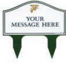
Part No. 592

Produced from a single piece of 3mm metal, finished with a very durable powder coat. Available in Single Spike or Twin Spike